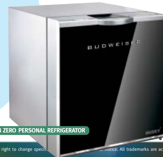
ZUB ZERO PERSONAL REFRIGERATOR