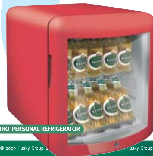
RETRO PERSONAL REFRIGERATOR